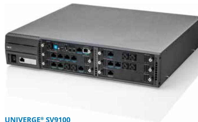
UNIVERGE® SV9100 Free MyCalls Desktop Lite

FREE with every SV9100 - a slimmed down version of MyCalls Desktop – this offers similar functionality bar, presence and 10 as opposed to 1000 DSS (Speed Dial & Busy Lamp Field) keys.