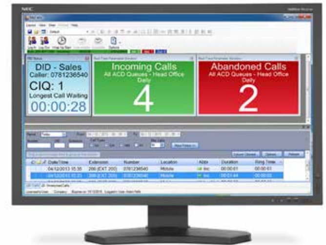
A real-time snapshot of all personal call activity including agent status, call history plus a mini wallboard of group activity

“Allows even a small team to deal with fluctuating call traffic”