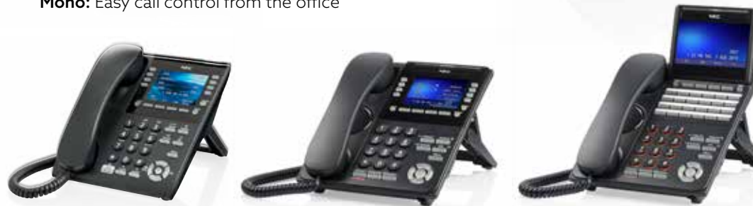
Color: Easy call control from the office, remote or home-based working, hot-desking