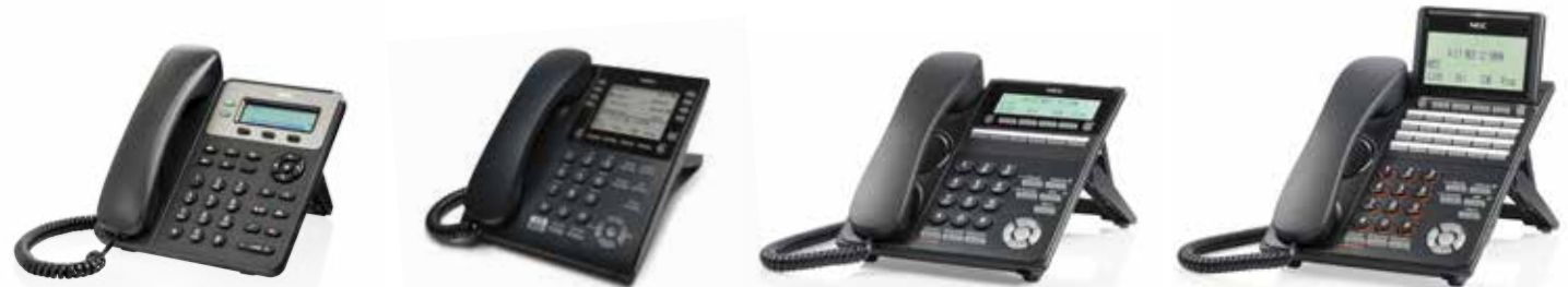
Mono: Easy call control from the office

For the full range of SV9100 handsets visit www.nec-enterprise.com for further details.